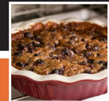
Butterscotch Bourbon Peach Cobbler