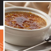
Pumpkin Crème Brûlée

Flavours Catering (808) 956-2186 catering@hawaii.edu