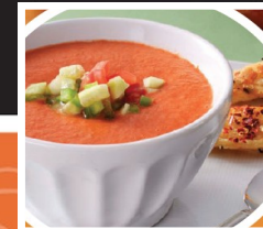
Gazpacho Andaluz Tomato Soup